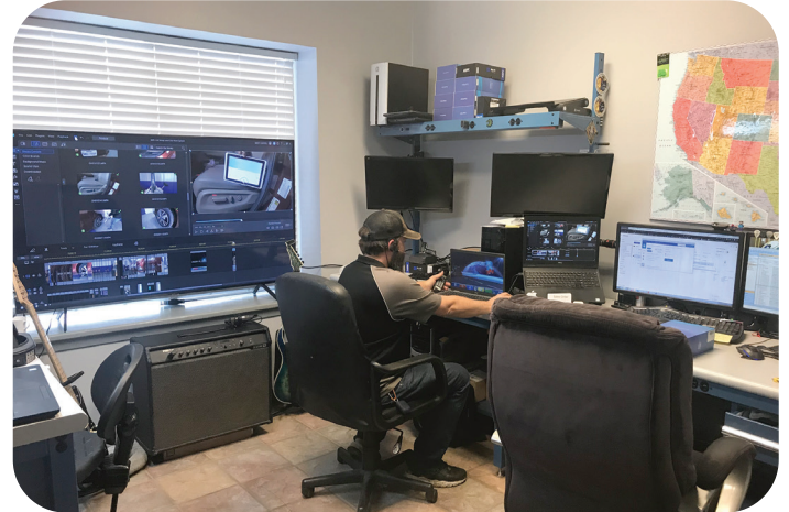
Technical Call Center